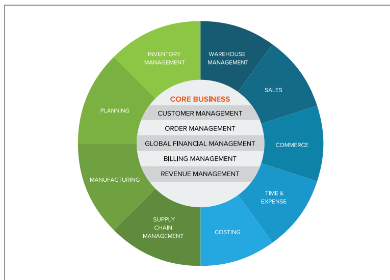
Figure 1: NetSuite provides a full business solution for manufacturers.

Since it’s a cloud-based application, manufacturers can benefit from NetSuite’s rich functionality immediately, and at lower upfront costs, than legacy approaches.